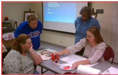
Intro to Watercolor