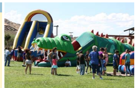
Fall Festival at Civic Center Park