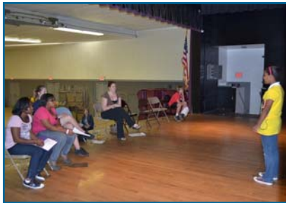
Auditioning for the Actor