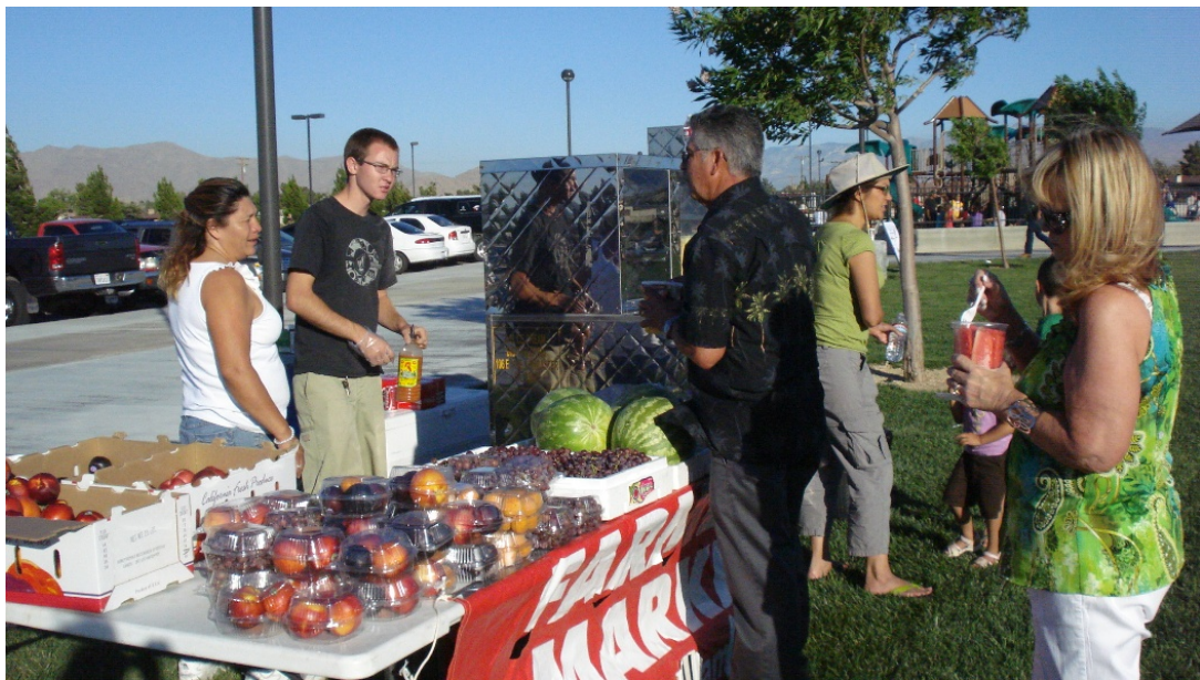
Apple Valley Farmer's Market