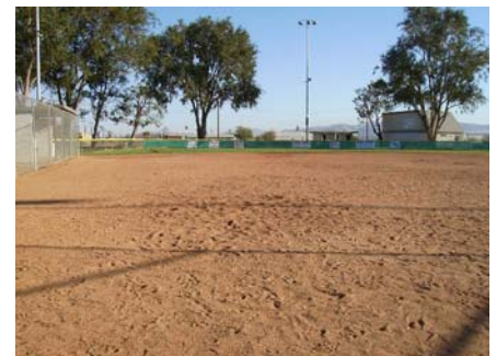
James Woody Park