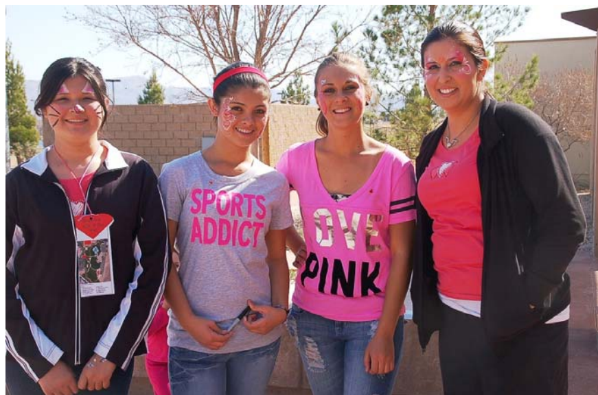
Our Teen Zone members participated in the HeartChase event and won 3rd place. They worked together, did not give up on the physical challenges and researched heart disease and heart health before the event.