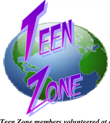
Teen Zone members volunteered at a prom held for local special needs teens. They were very friendly, open-minded and compassionate towards the students - a proud representation of the Teen Zone program.