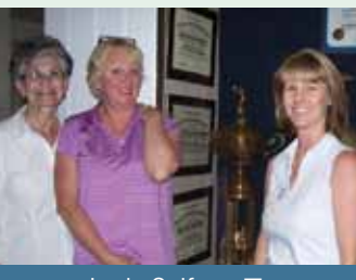
Lady Golfers 7