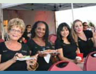
Sponsors Save Events 8