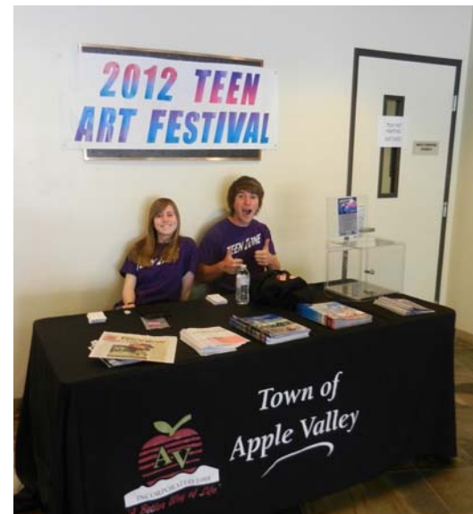
Teen Zone members working at the Teen Art Festival.