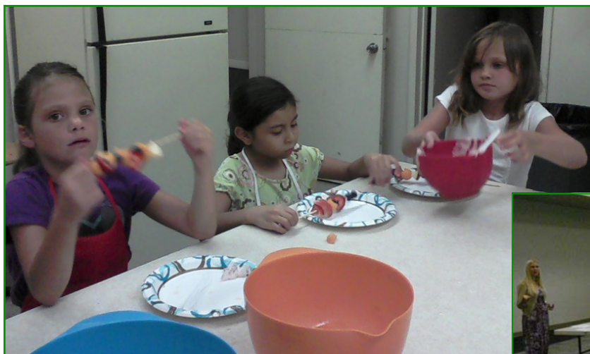
Healthy Cooking for Kids – March 15