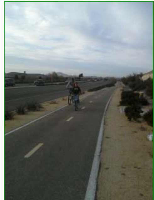
Sunset Cycling – March 23