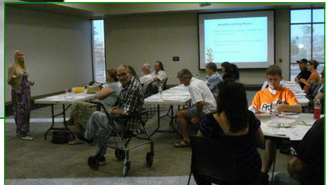
Healthy Living Workshop – March 13-27