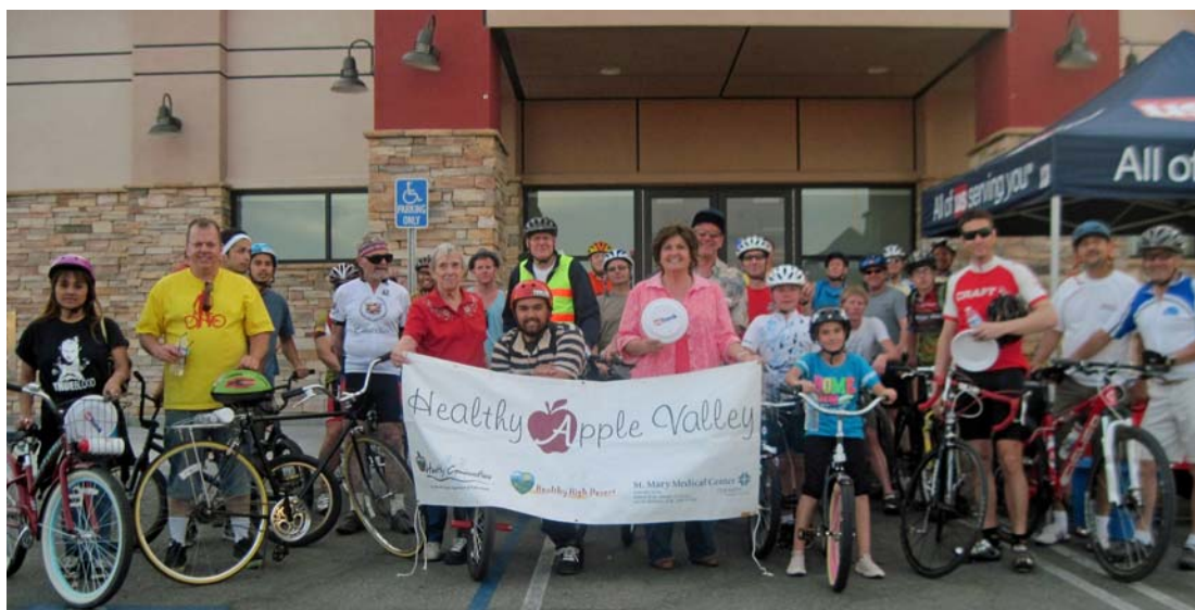
Bike For Bicycle Lanes in the High Desert - 2012 Advocacy Ride - May 7, 2012 supported by Mayor Stanton and Healthy Apple Valley