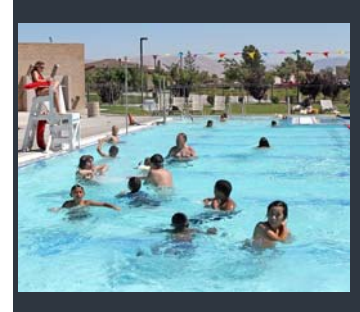
Open Recreation Swim