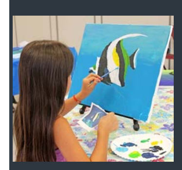
Summer Art Workshop