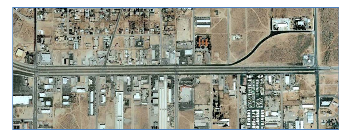
Highway 18 Landscaped Median Project