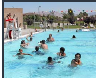
Open Recreation Swim

*Open Recreation Swim was cancelled effective September 12th due to low attendance.