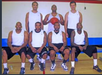
Adult Basketball League