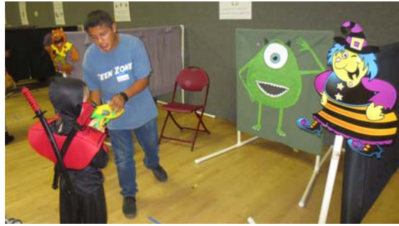
(Left) A majority of the game booths at this year's Kiddie Carnival were ran by Teen Zone members.