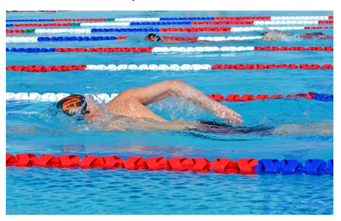
nap - Figures not applicable min - Minimum participation not met NO - Not offered