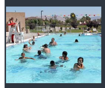
Open Recreation Swim