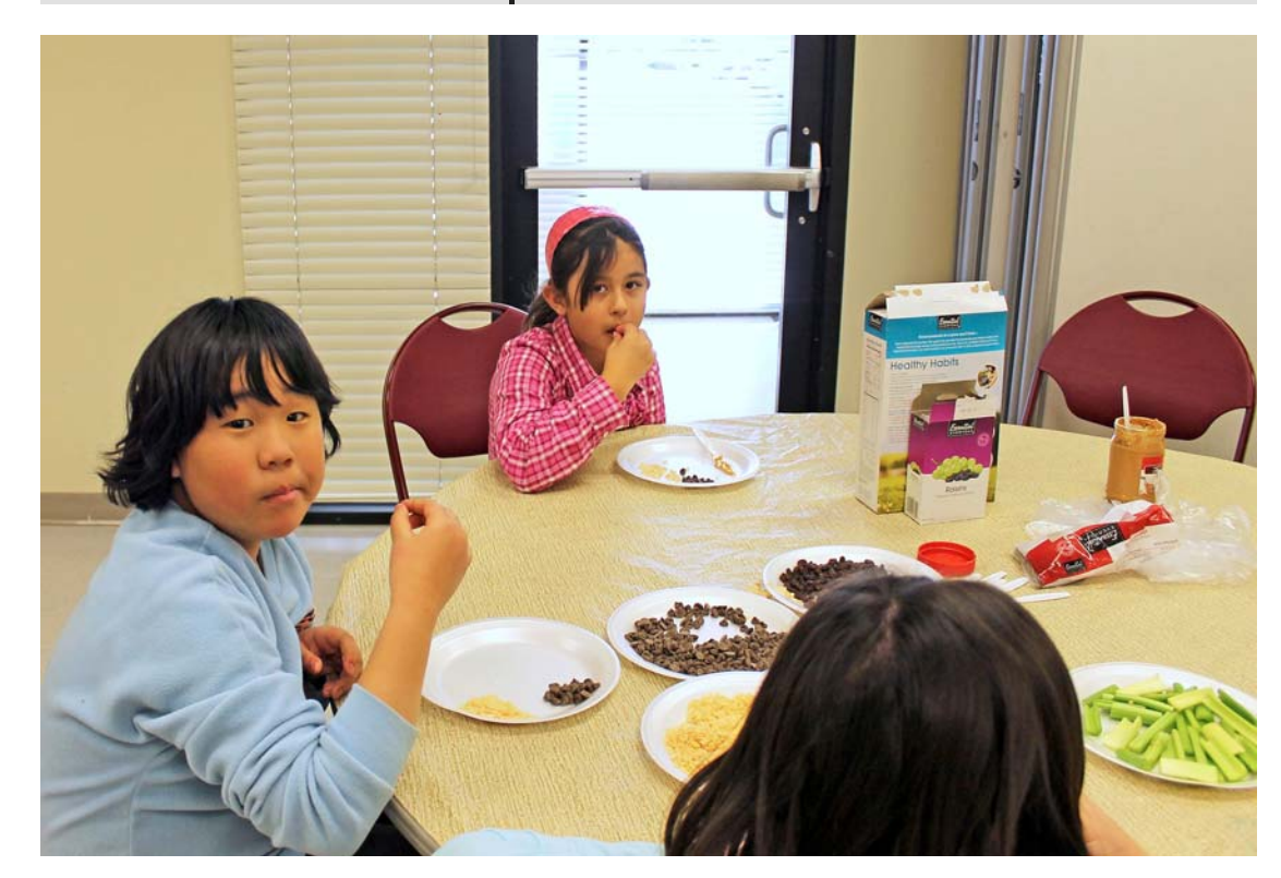
Day Campers were given a lesson in health and nutrition and enjoyed a healthy snack as part of the program's daily activities.