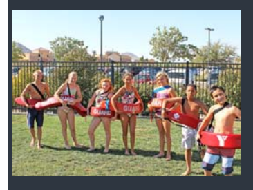
Open Recreation Swim