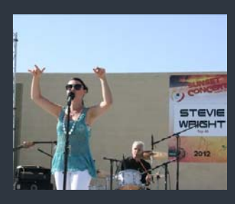
Sunset Concert Series