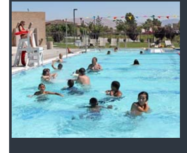
Open Recreation Swim