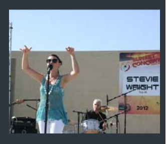
Sunset Concert Series