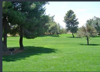
James Woody Park