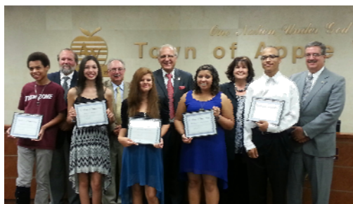
(Left) Teen Zone members who donated over 100 hours were recognized by the Town Council on August 27.