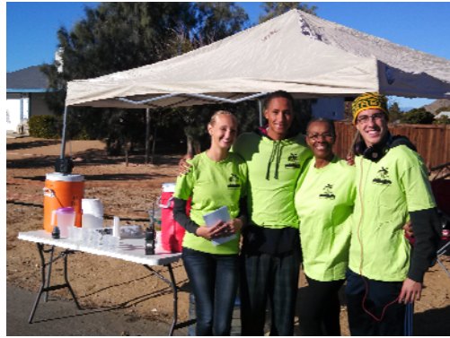
(Left) Volunteers help out at a water station during the Reverse Triathlon on September 28th. .