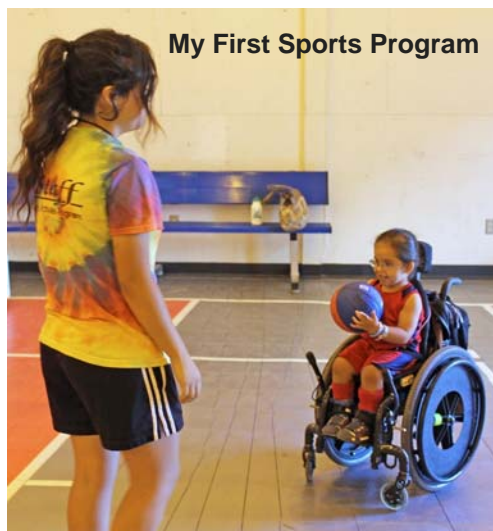
My First Sports Program