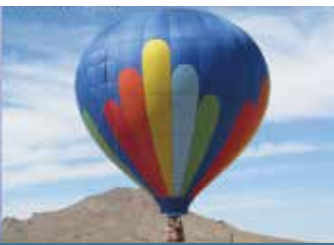
Free Community Calendars 2