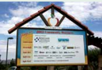
Save Apple Valley Events 7