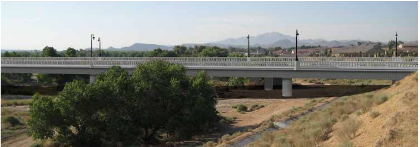
Rendering of the Yucca Loma Bridge as it is expected to look after its completion.

January 2014 will see the start of the much-anticipated Yucca Loma Bridge, a project more than 40 years in the making! In December, the Town Council awarded a $37.3 million contract to Security Paving, Inc. for the construction of the Yucca Loma Bridge over the Mojave River and Yates Road Improvements project. A ground breaking ceremony is scheduled for Friday, January 10.