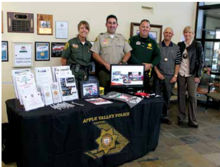
Police staff shared information on programs and services at the 25th Anniversary Open House in November.