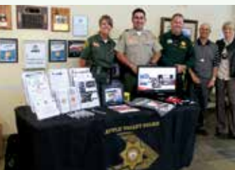
Police Programs 5