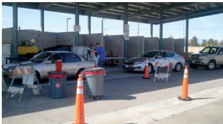
Residents take advantage of the convenient, drive-up and drop-off location of the Apple Valley Household Hazardous Waste Collection Center every Saturday from 10 a.m. to 2 p.m.

What do old paint, broken fans, obsolete computer monitors, batteries and expired medicines have in common? They are all things that can be brought to the Household Hazardous Waste collection center in Apple Valley.