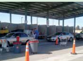
What do I do with this? 9