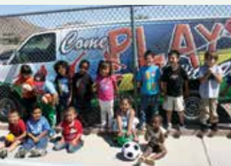
National Heart Month 6