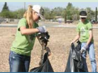
Community Clean Up Day 12