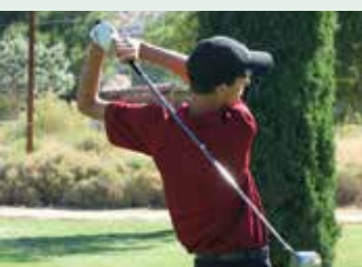
Golfing Opportunities 10