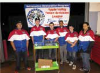
Gang Intervention Grant 8