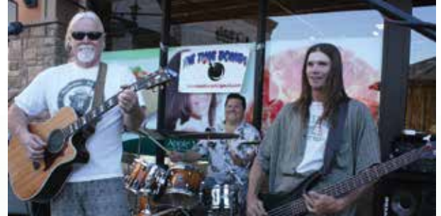
Time Bombs will return to The Courtyard to kick off the spring concert series on May 1.

For more information please visit www.AppleValleyEvents.org or call (760) 240-7000 x 7071. ☺