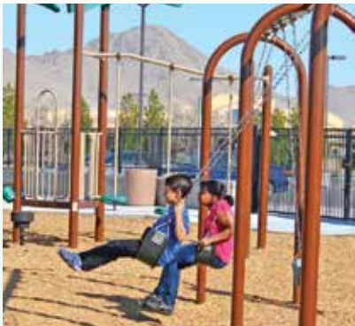
Children and adults can breathe easy, with a new ordinance that bans all smoking at Town parks.

Demonstrating a clear commitment to the Healthy Apple Valley initiative, the Town Council unanimously passed an ordinance to ban smoking from all Apple Valley parks. In effect March 27, the ordinance eliminates the designated smoking areas, creating a completely smoke-free environment for park patrons.