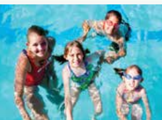
Recreation Achievement 6