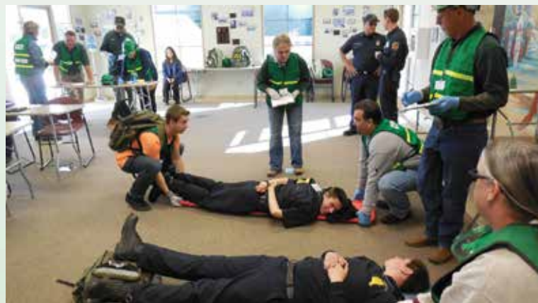
CERT volunteers train at the Victor Valley College Public Safety Center in North Apple Valley. A new class starts April 19.

Trained CERT (Community Emergency Response Team) volunteers play an important role when a disaster strikes. Hundreds who have gone through the class can take care of themselves, their families, neighbors and co-workers, freeing up emergency personnel for critical situations. Prepare yourself for disasters by learning about basic first aid, search and rescue, terrorism, disaster psychology and more at a CERT class, offered free by the Apple Valley Fire Protection District. The next