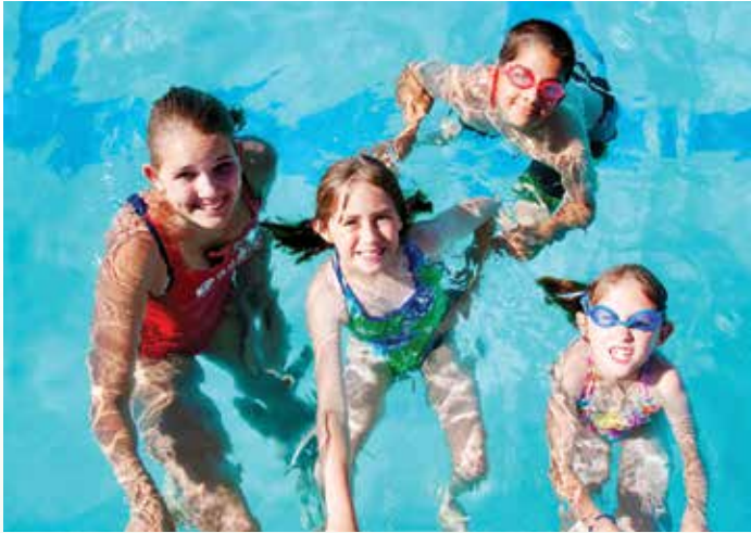
There's no need to be bored on spring break or summer vacation. Our pool is just one of the many amenities residents can take advantage of.

You've always known Apple Valley has a great parks and recreation system. Now the Town has an award to show for it! The department recently earned an Award of Excellence from the California Park & Recreation Society (CPRS) for its Parks and Recreation Master Plan.