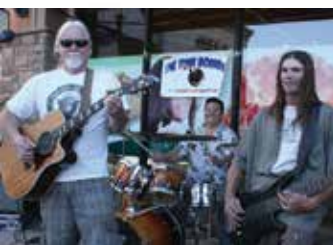
Live Music in the Courtyard 4