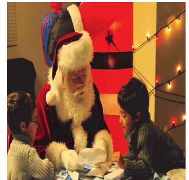
Cocoa & Carols with Santa