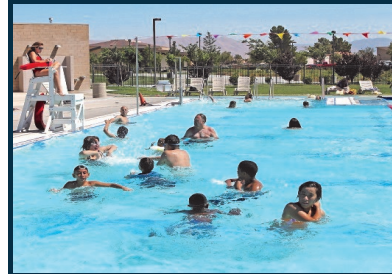
Open Recreation Swim