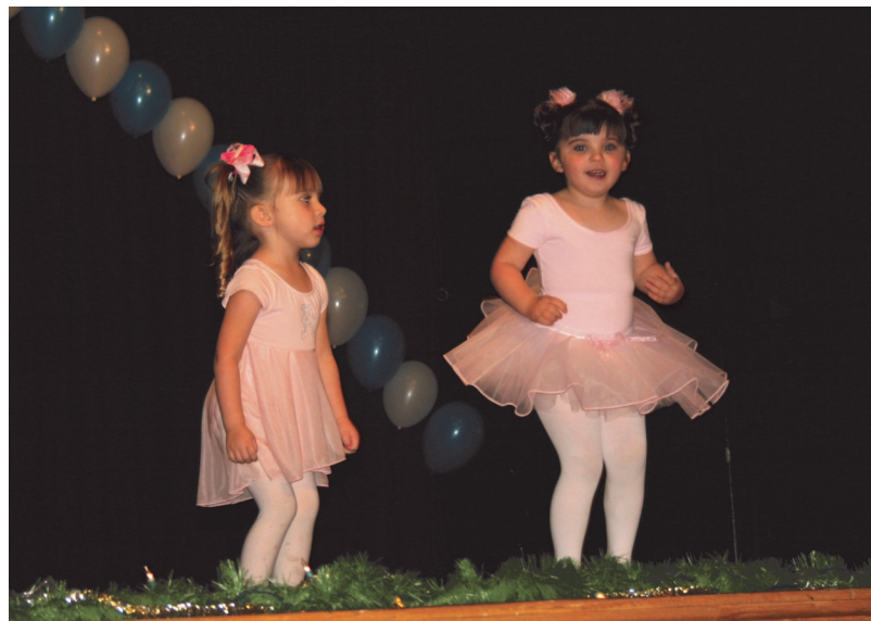
Most Talented Kids participants.