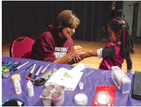
(Left) Teen Zone volunteers work the face painting booth at the Kiddie Carnival.