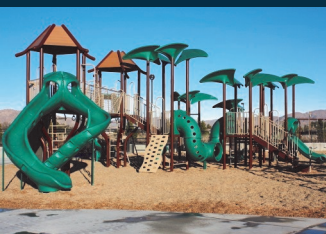
Civic Center Park