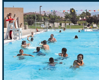
Open Recreation Swim