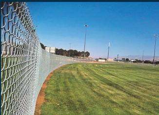
James Woody Park