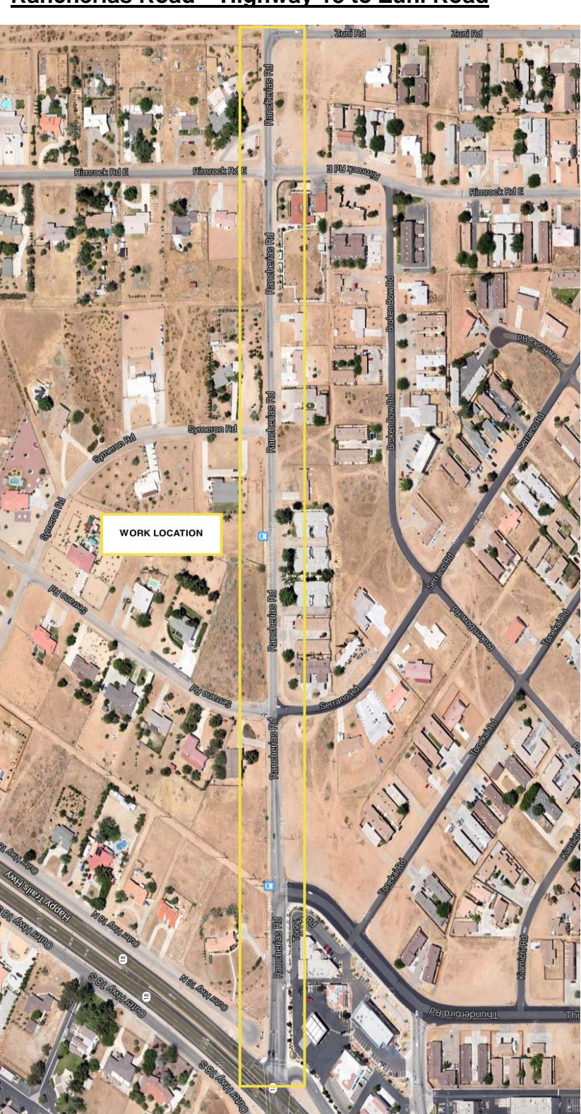
Rancherias Road - Highway 18 to Zuni Road