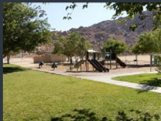
Civic Center Park