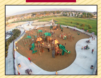
Rate Stability WHY YOU WILL BE BETTER OFF ... Page 3