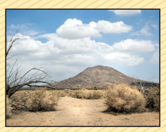
Conservation WHAT YOU CAN DO TO FIGHT THE DROUGHT ... Page 4