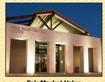
Fair Market Value HOW THE TOWN WILL PAY FOR ACQUISITION ... PAGE 2

Thank you for the continuing opportunity to serve you. Apple Valley is your Town. Water is your asset.