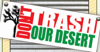
Working Together DON'T TRASH OUR DESERT...Pg. 5