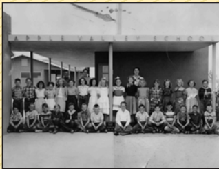
Turning 65! YUCCA LOMA SCHOOL...Pg. 2