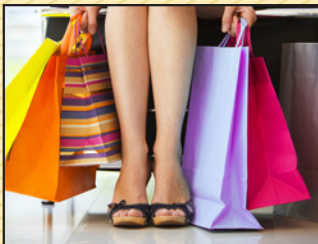
Shop Local THINK APPLE VALLEY...Pg. 12