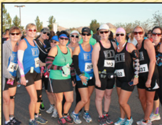
Challenging Competitors REVERSE TRIATHLON...Pg. 6