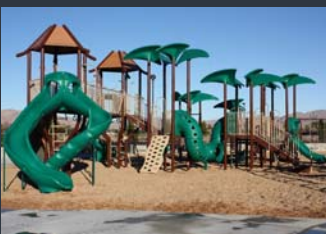
Civic Center Park