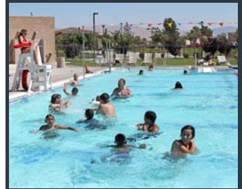
Open Recreation Swim