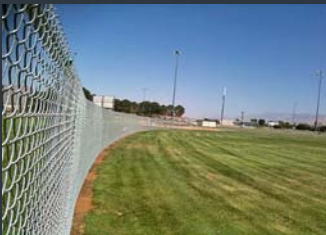
James Woody Park