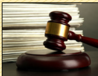
No Choice EMINENT DOMAIN Page 3