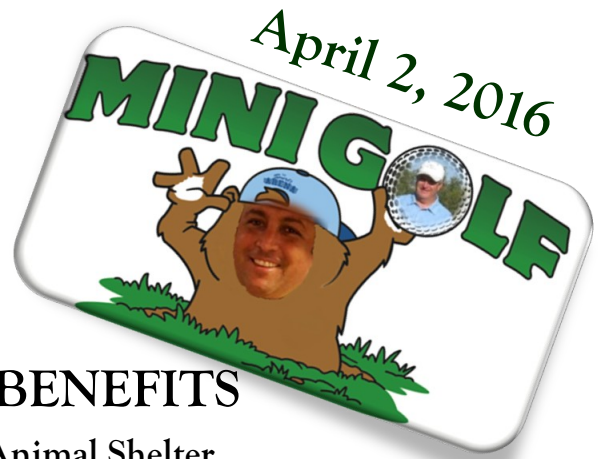
TABLE LEVELS AND SPONSORSHIP BENEFITS

For your generous support of the Apple Valley Municipal Animal Shelter, we offer the following benefits: