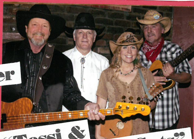
"Tessi & the Calico Cats"