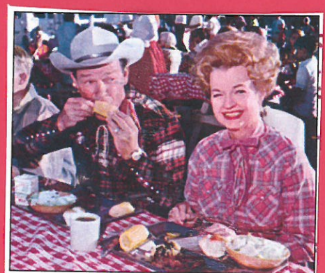
Roy Rogers & Dale Evans enjoying a past Steak Fry at the Apple Valley Inn!

Tickets available at museum at the Apple Valley Inn #153 or call (760) 985-1918