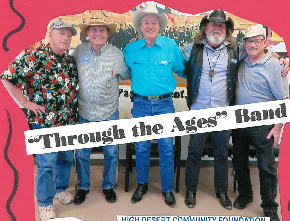
"Through the Ages" Band