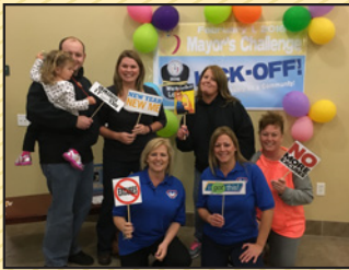
2nd Annual Mayor's WEIGHT LOSS CHALLENGE...Pg. 2