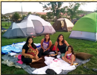
Apple Valley Aquatic Center WATER PLAY...Pg. 6