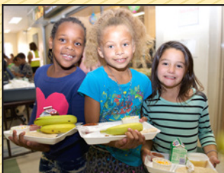
Meals & Activities for LOCAL CHILDREN...Pg. 11