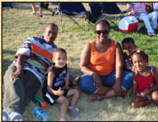
America's Birthday! FREEDOM FESTIVAL...Pg. 4