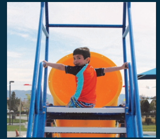
Open Recreation Swim