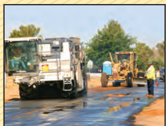
Pardon Our Dust ROAD WORK...Pg. 11