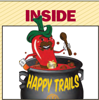
Happy Trails CHILI COOK OFF...Pg. 3