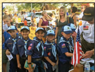
National Night Out ENDING CRIME...Pg. 9