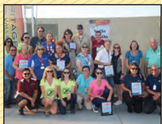
Save Apple Valley Events S.A.V.E. ...Pg. 5