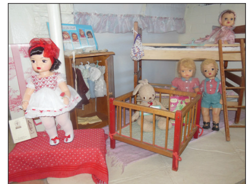
Terri Lee Dolls handmade in A.V.