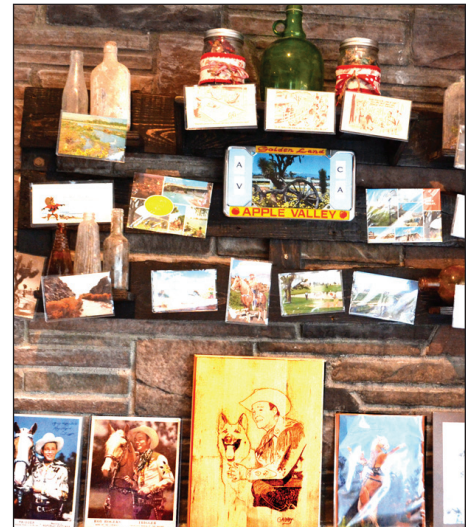
Roy Rogers photos, Apple Valley post cards