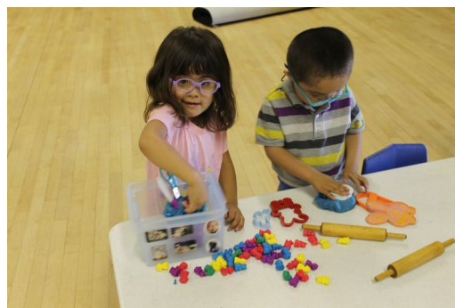
Making treats with Play-Dough at our Academic Tots preschool class.