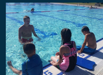
AV Swim Club