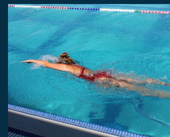
Morning Lap Swim