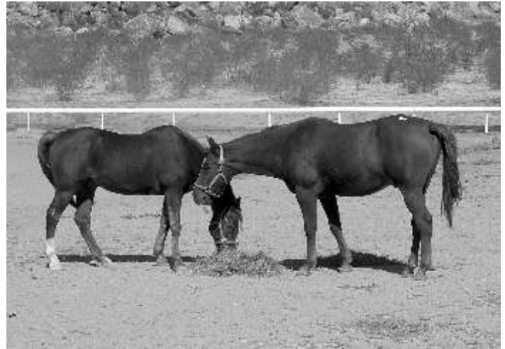
Horses enjoy the donated feed at the animal evacuation site set up at Horsemen's Center. At one time, over 100 livestock were safely sheltered and cared for by Town staff and volunteers.

In the end, the biggest impacts on Apple Valley were in terms of sheltering both human and animal evacuees from the mountain communities and in providing fire-fighting support. The American Red Cross used Apple Valley High School to house as many as 200 displaced mountain residents. In addition, the School District put up several strike teams of firefighters for several nights in the Tony Balsamo Performing Arts Center. An animal shelter was opened at Horsemen's Center and at its height was home to