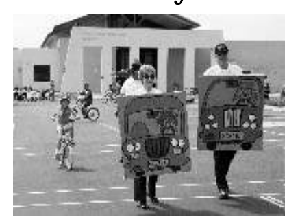
Kids can learn the rules of the road at the Bicycle Rodeo.

The annual Children's Safety Fair will be held Saturday March 19 from 10am till 2pm at the Town of Apple Valley front parking lot. Take part in a "bicycle safety course" where kids can learn the rules of the road. Apple Valley Police and Fire Departments, The Town of Apple Valley, St. Mary's Medical Center, California Highway Patrol, Life Chiropractic Inc., High Desert Center, Full Gospel Church and other agencies will be participating. We will have a variety of booths set up offering information on child safety and health related fields, including fingerprinting. Attendance is free. Bring your bikes for a free bicycle maintenance safety check.