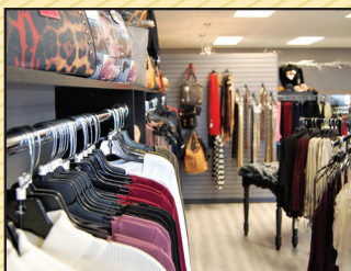
Now Open 28TH AVENUE FASHIONS...Pg. 3