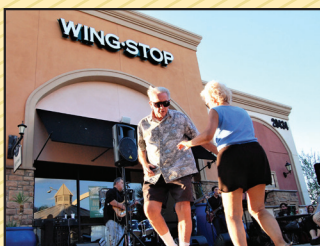
Now Open WING STOP...Pg. 11