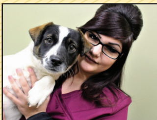
Pet Match STRAYS TO STARS ...Pg. 7