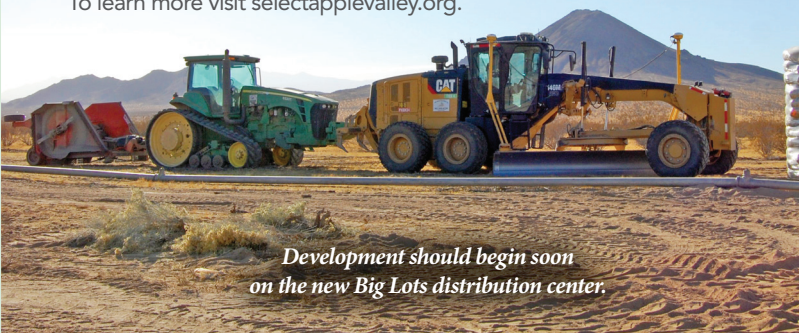
Development should begin soon on the new Big Lots distribution center.

To learn more visit selectapplevalley.org .