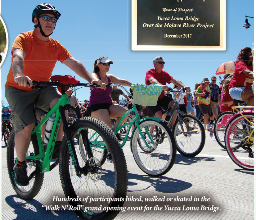
Hundreds of participants biked, walked or skated in the "Walk N' Roll" grand opening event for the Yucca Loma Bridge.