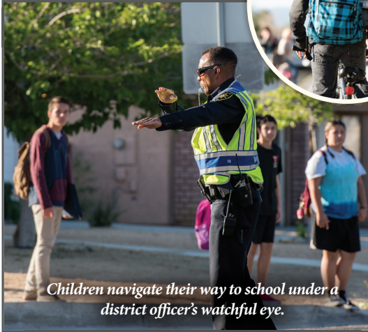
Children navigate their way to school under a district officer's watchful eye.