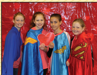
Recreation HEART GAMES ...Pg. 4