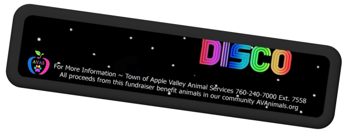
TABLE LEVELS AND SPONSORSHIP OPPORTUNITIES

YES, I would like to help the Apple Valley Municipal Animal Shelter in the following way(s):