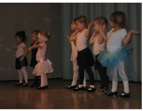
The Tiny Tot Dance class for ages 3 - 5 is a popular program that continues to fill to capacity each month.