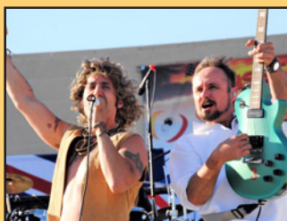
Sunset Concert Series LIVE MUSIC ...Pg. 6