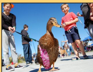
Apple Valley PET FAIR RETURNS...Pg. 12