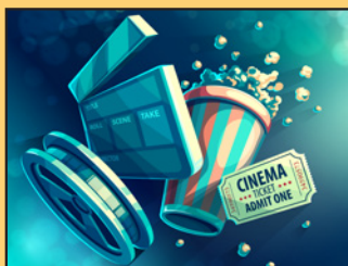
Stay Cool POOL ACTIVITIES ...Pg. 5