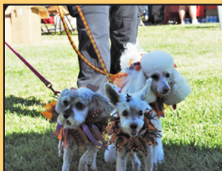
Apple Valley PET FAIR RETURNS...Pg. 9