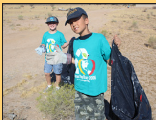
Community Enhancement CLEAN-UP DAY...Pg. 14