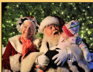
Holiday Traditions UPCOMING EVENTS...Pg. 4