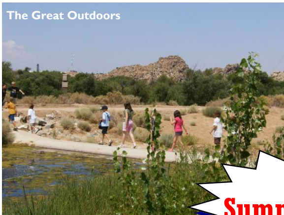
The Great Outdoors