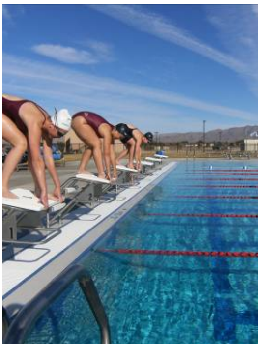
Apple Valley WAVE