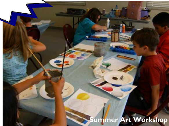
Summer Art Workshop