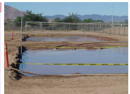
Mud Volleyball courts at Horsemen's Center