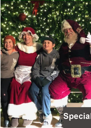
(Left) Santa and Mrs. Claus with kids attending the Christmas Tree Lighting.