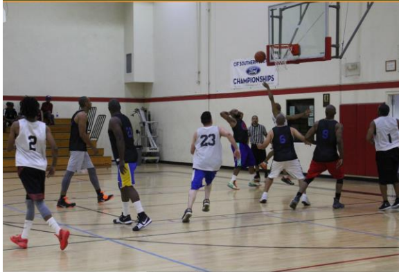
(Left) Adult basketball players at the Michael H. Martin Gym.