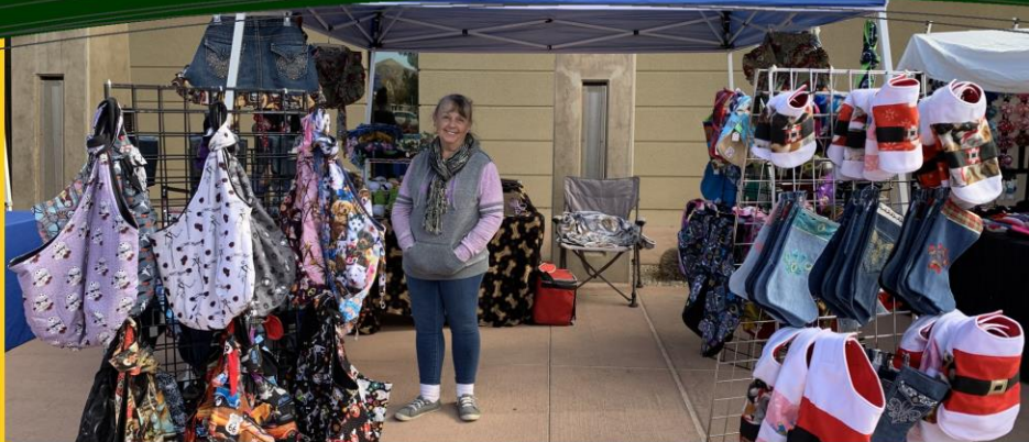
(Right) Vendors at the 2019 Holiday Craft Fair