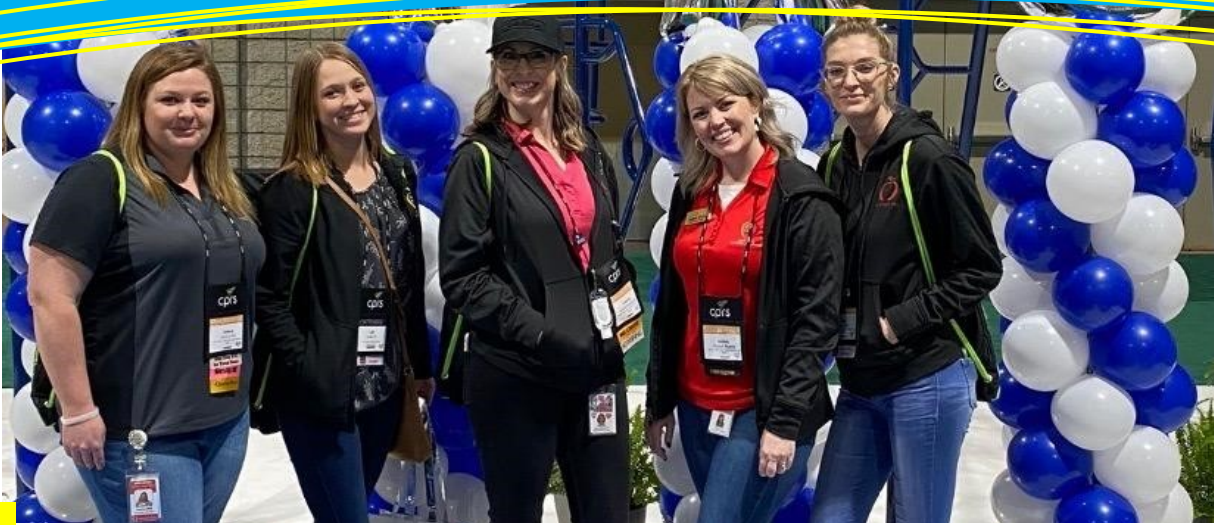
(Right) Recreation Staff at the CPRS Conference in March.