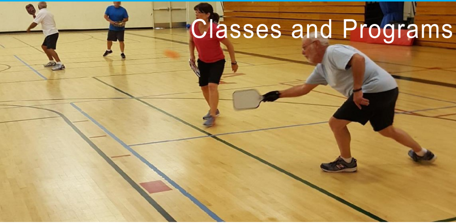
(Left) Participants playing Open Pickleball at the Michael H. Martin Gym.