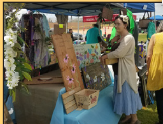
Town Calendar UPCOMING EVENTS...Pg. 3