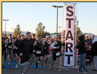
Sports and Running Events COMING SOON...Pg. 7