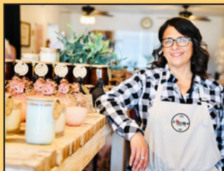
Shop Apple Valley NEW BUSINESSES...Pg. 5