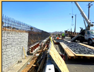
Road Widening PROJECT PROGRESSES...Pg. 8