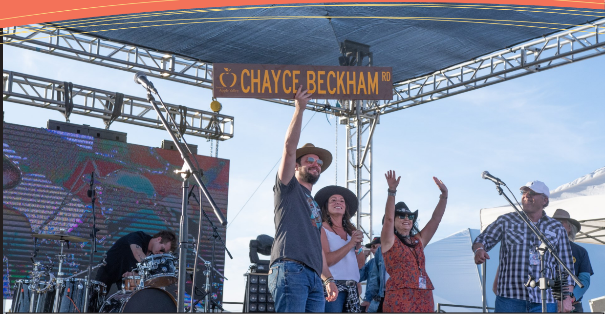
Chayce Beckham "Boots in the Desert" Concert