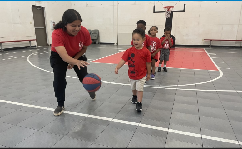
Pee Wee Basketball Training. Fun in action!