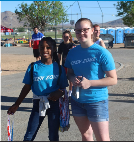
Volunteers spending time helping the Apple Valley community