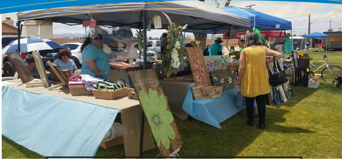
Rockin' Flea Market vendors showcase their items. It was well attended!