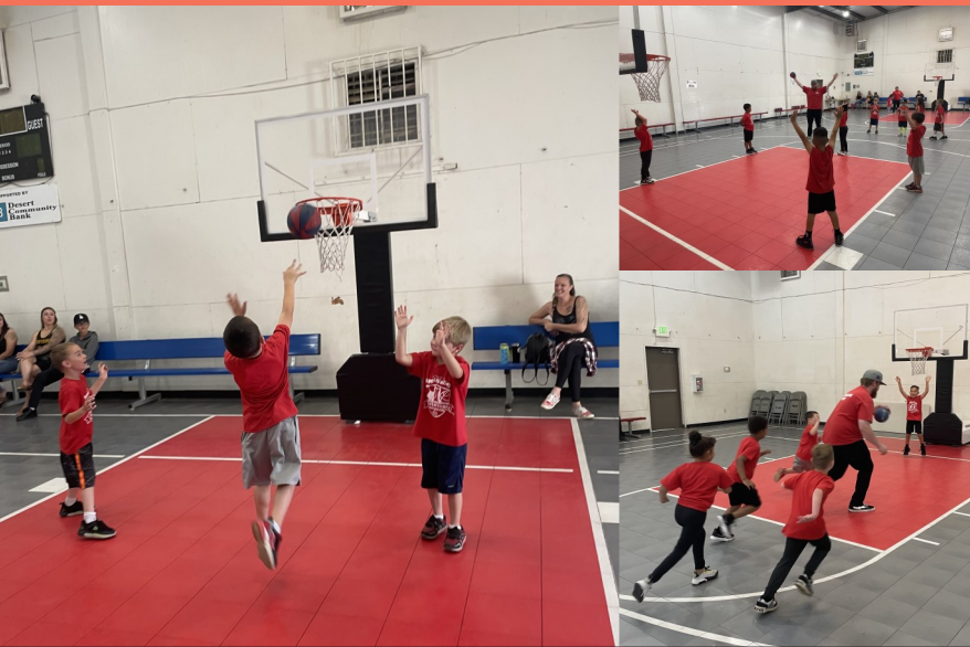
Pee Wee Basketball participants shootin' hoops