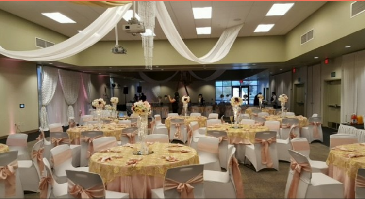
Conference Center used as a wedding venue