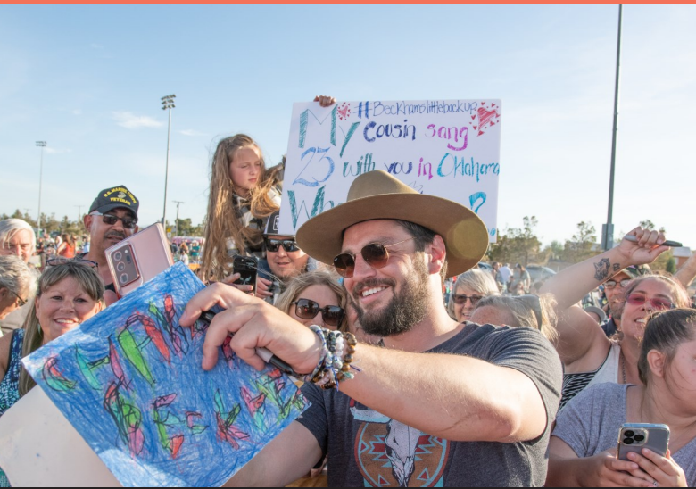
Chayce Beckham posing with fans