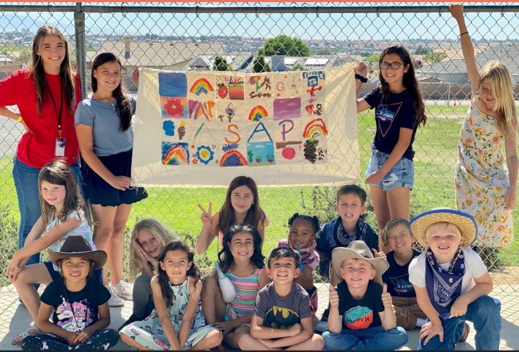
ASAP children and volunteers showing off their flag