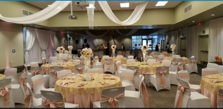
Conference Center being used as wedding venue.