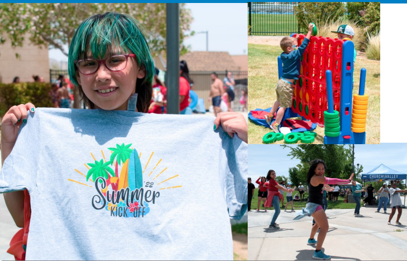
Youth attending the 2022 Summer Kickoff Event!