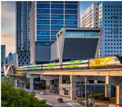
Miami Central features office, residential and retail