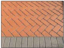
STAMPED COLORED ASPHALT PAVING

NOTE: ALL PLANTER BEDS WILL BE TOP DRESSED WITH 3" LAYER OF DECOMPOSED GRANITE AND/OR ROCK MULCH