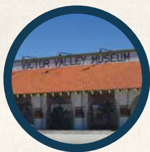
Victor Valley Museum

The Victor Valley Museum maintains and develops a unique cultural and natural science collection related to the High Desert that includes geological and palaeontological specimens, Native American artifacts, and historical objects.