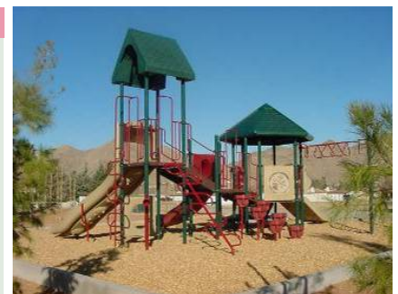
Mountain Vista Park