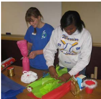
Volunteens gift wrapping