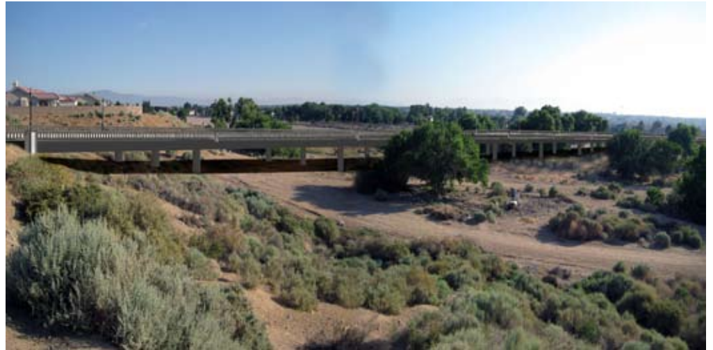
This photo simulation depicts what the Yucca Loma Bridge will look like when completed. The view is looking south from the north east bank of the Mojave River.

Code Enforcement ..... 240-7560 Parks & Recreation ..... 240-7880 Trash (AVCO) ..... 245-8607 Emergency Preparedness ..... 247-7618