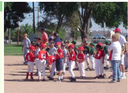
Little League Opening Day