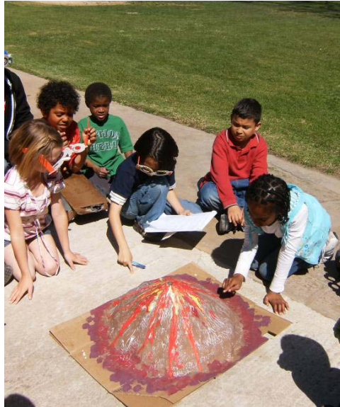
Wacky World of Science Week at Day Camp

*Participation in Shotokan Karate significantly decreased due to instructor opening his own studio. March 2008's participation was 80 students.